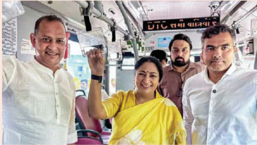
Delhi Chief Minister Rekha Gupta on Monday launched the 'Metro Monday' initiative

During the launch, Chief Minister Gupta appealed to citizens to use public transport as much as possible,