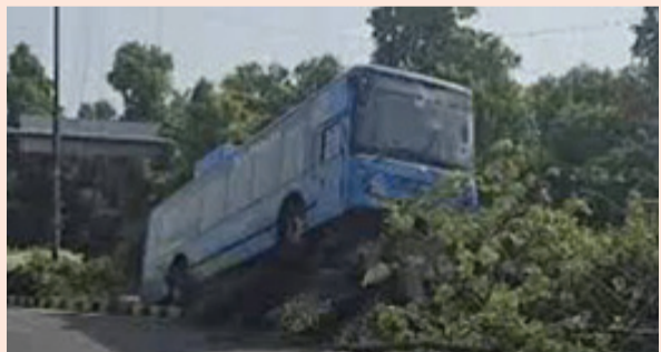
DTC bus mounted a road divider near the Rajghat traffic signal in central Delhi on Sunday

Several videos of the incident surfaced on social me-